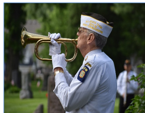
From Previous Groveland Ceremony

friends and neighbors to come and enjoy the fellowship, conversation and refreshments with everyone before and after the service. Parking is available in the Groveland School east lot. Enter the cemetery through the gate near our utility building. We are looking forward to seeing you on this special occasion. Flags will mark the graves of our approximately 350 veterans.